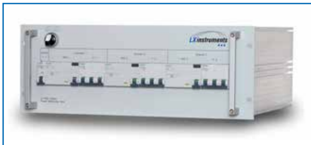
LX-PDU-03-63G: three-phase basic unit