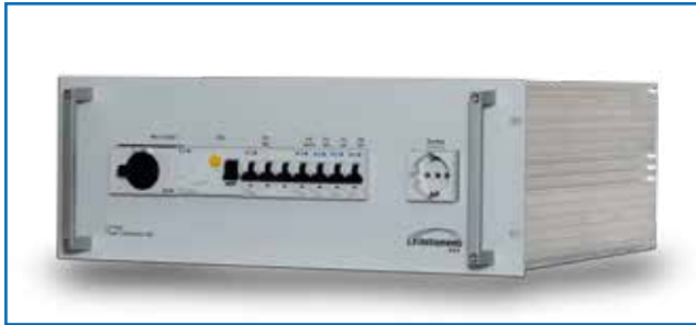
LX-PDU-01-10G / LX-PDU-01-13G: single-phase basic unit